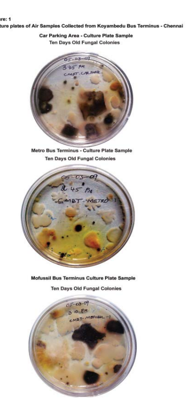
Figure 1. Culture plates of air samples collected from Koyambedu Bus Terminus, Chennai

growing. The growth of the fungul spores were observed and recorded (figure-1).